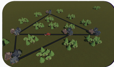
Portfolio Project: City Builder

Dive into the intricacies of selecting the ideal data structures and algorithms tailored to specific scenarios and challenges. Grasp the nuances of basic algorithm design techniques, analyze algorithmic complexity, and implement use common data structures, ensuring solutions are both effective and efficient.