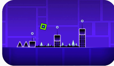
Portfolio Project: Clone App

Learn to create games for mobile platforms. You will gain skills in mobile-specific input handling, performance optimization, and preparing games for deployment on app stores. In this unit, you will clone an existing mobile game and add features to enhance its user experience and functionality.