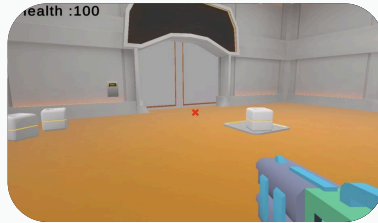
Portfolio Project: Turning Test

Delve into the importance of structuring code for robustness and scalability. Central to this approach are industry-standard design patterns, that solve common problems and challenges. Employ these design patterns to create scalable games, and gameplay mechanics anchored in a detailed game design document.