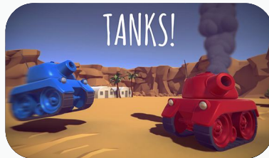
Portfolio Project: Tanks

Learn how to develop multiplayer games will enable you to tap into the rapidly expanding market of online gaming, allowing you to reach a larger and more engaged audience. Mastering multiplayer development in Unity enhances one's programming and problem-solving skills, as it involves complex networking concepts, synchronization, and server-client interactions.